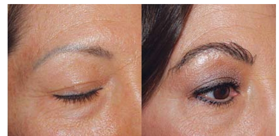
In a single procedure, as many as 300 grafts can be inserted into each eyebrow for the most impressive result.