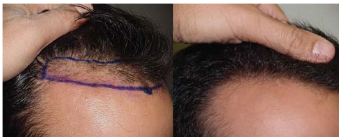
2000 follicular unit grafts were densely packed to achieve a natural yet dense hairline.

TREATING ALL TYPES OF HAIR LOSS - visit our websites FoundHair.com, WomensCenterForHairLoss.com, and EyebrowTransplantation.com to see for yourself how the most advanced hair transplant techniques can treat male and female hair loss, repair the unaesthetic results of prior performed procedures, lower overly high hairlines, and restore eyebrows, beards, and other body areas.