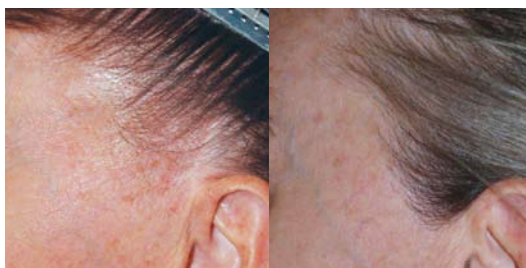
In cases of scarring from prior plastic surgery- in this case a facelift- hair can be restored with modern transplant techniques.